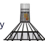
Metropolitan Cathedral of Christ the King Liverpool