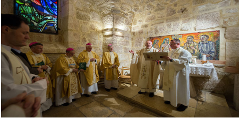
Mass in St Jerome's cave in the Church of The Nativity