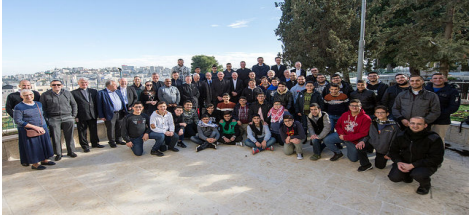
Latin Patriarchal Seminary in Beit Jala