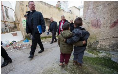
Visit to UNRWA camp and school in Jenin