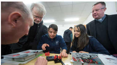
Visit to Sisters of Nazareth High School in Haifa