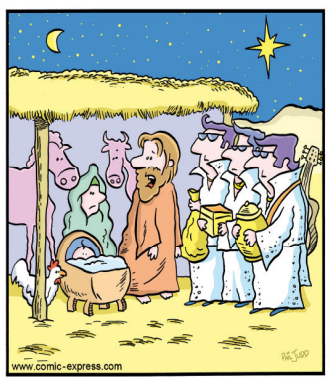
"They say they are three kings."

What is my mission? What is God calling me to do? How can I fulfil my mission?