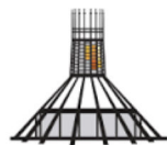
Metropolitan Cathedral of Christ the King Liverpool

LOURDES SPECIAL WEEKEND DEPARTURE BY AIR FROM MANCHESTER TO CARCASSONNE