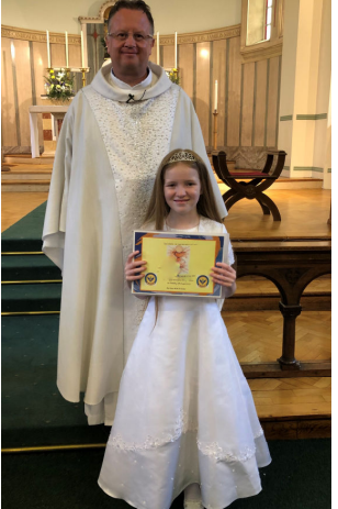
Congratulations to our children who made their First Holy Communion last week