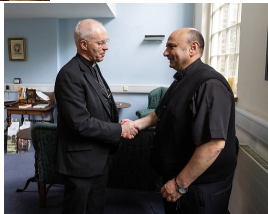
Meeting and prayers with The Archbishop of Canterbury