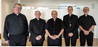
International Affairs Department meeting