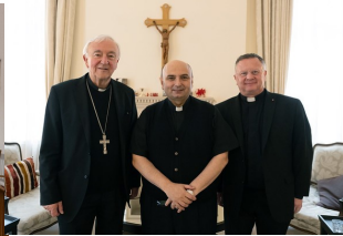
Meeting Cardinal Vincent Nichols