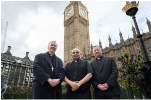
Meetings at the Houses of Parliament