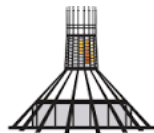
Metropolitan Cathedral of Christ the King Liverpool

During 2024 the Metropolitan Cathedral are celebrating the return of their restored grand organ with a series of concerts and events that will demonstrate the versatility of the instrument.