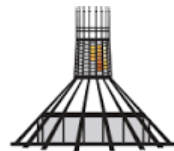
Metropolitan Cathedral of Christ the King Liverpool

All are warmly invited to the Annual Lourdes Mass at the Metropolitan Cathedral on Sunday 13 July at 5.00pm, with Archbishop Emeritus Malcolm presiding.