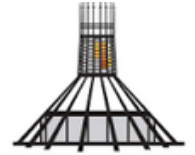
Metropolitan Cathedral of Christ the King Liverpool

We are having a Pilgrimage Walk on Saturday 20th September 2025, 11am start with Mass at 1.30pm, St Mary's Shrine Church, Prescot Road, Ormskirk, L39 6TA.