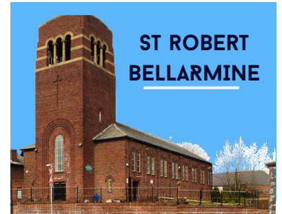
ST ROBERT BELLARMINE

A main feature of the Easter season is our reading from the Acts of the Apostles at Mass each day, it offers us a timely and reassuring reminder about the life of the Church.